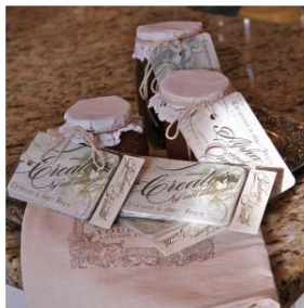
TIDINGS IN TRUTH TAGS