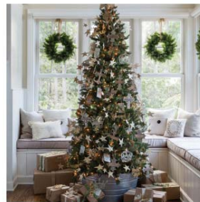
ADORNMENTS® TREE SET