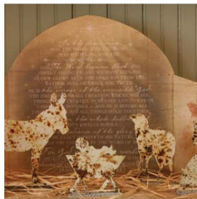
HE CAME NEAR NATIVITY