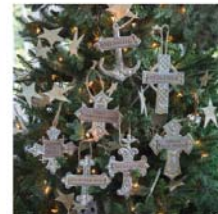
ADORNMENTS® HIS SAVIOR NAMES