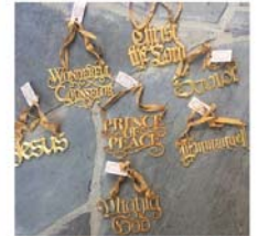
ADORNMENTS® HIS CHRISTMAS NAMES