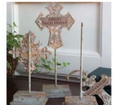
HIS SAVIOR NAMES STAND