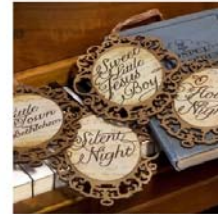
ADORNMENTS® ADORE HYMNS

“Every woman's home is an expression of who she is--her values, her faith, her relationships. She naturally gathers family and friends to celebrate holidays and special occasions. But in the busyness of life it is sometimes difficult to know how to focus on gratitude at Thanksgiving, honor Christ at Christmas or celebrate the hope of Easter in meaningful ways. We at Ever Thine Home want to help you add that which lasts forever in your home and family all year long.”